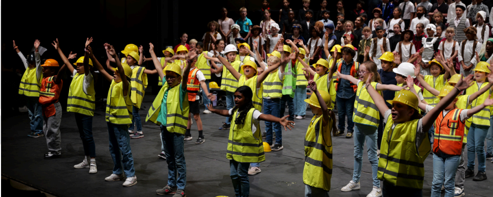
Junior School Production