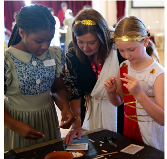
Y5 Ancient Greek Day