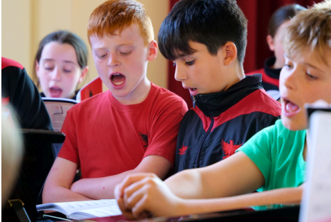
Music in the Junior School