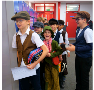
Y6 Victorian Day