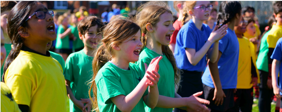
Sport in the Junior School