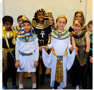
Y3 Egyptian Day