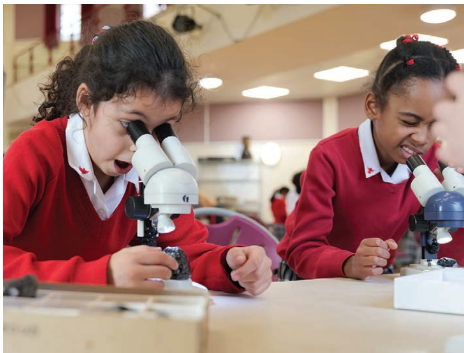
Learning about rocks and soils