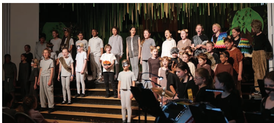
Junior School Production