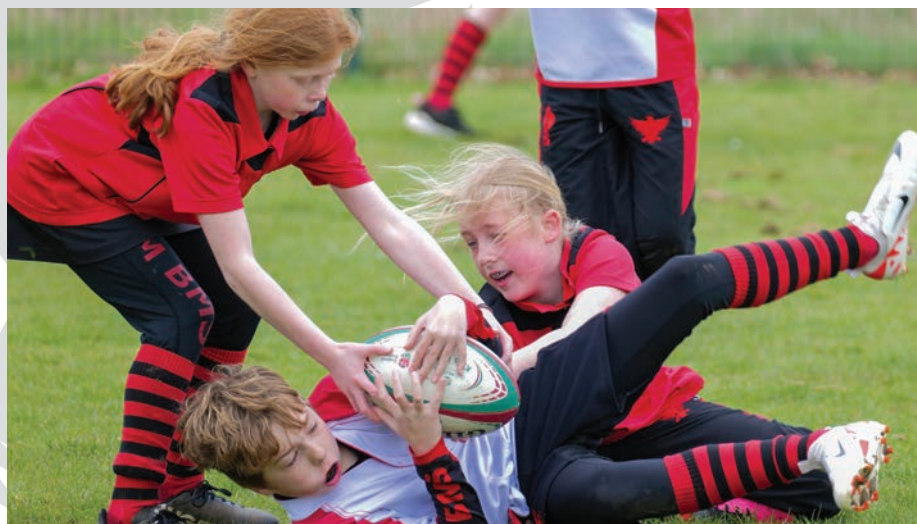
Sport in the Junior School